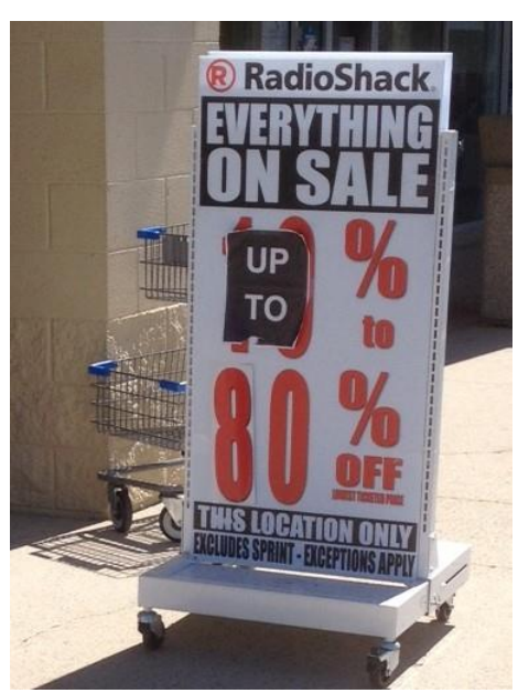
Above: Sign of the times for Radio Shack Store at 1091 Millcreek Road, Allentown, PA address.