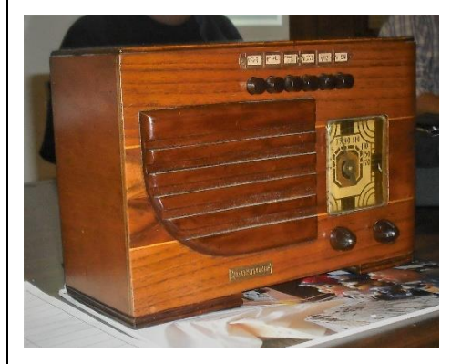
Above: Tom Spiegle exhibits a Simplex Tranistone UA-52P with outstanding dial art made with Philco chassis and Simplex cabinet as assembled in Ohio. Pre-Philco Transitones, as shown here, exhibited great deco styling in the late 30's with some amazing color combinations on plastic versions.