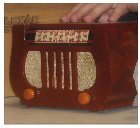
Above: Wilbur Gilroy brought several Catlin beauties; shown here is the DeWald model 501