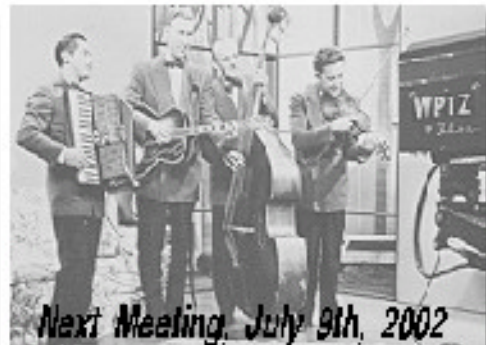
Next Meeting, July 9th, 2002 Telford Community Center 7:30 pm sharp tailgate auction