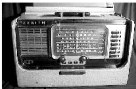
More on the white Zenith T/O from the internet by Mike Koste. Pages 6 & 7.