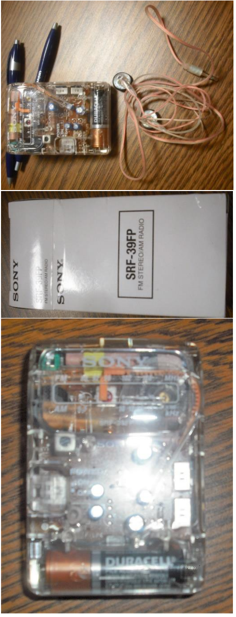
Above: There is nothing you can hide in this Sony SRF-39FP (FP= Federal Prison model). Prison culture holds that it is good luck to give your Sony SRF-39FP to another inmate before leaving.

AA cell could last up to 40 hours and because of their domintion became known as the "Ipod of prisons". Great design and sensitivity may have allowed for other than local stations opening listeners to nighttime skip reception. This unit is also highly regarded for the ultra-light category of DX contesting.