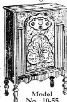
Model No. 10-55

Atwater Kent now introduces Screen-Grid Radio. It means new power to reach far-away stations—new sensitivity—new needling selectivity.