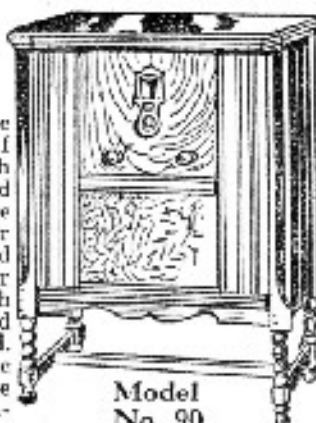
Model No. 90

MODEL 90 — The beautiful cabinet of Tudor design with handsomely grained butt walnut centre panel, fluted corner posts, top rail and side panels. Speaker opening covered with especially patterned bronzed material. Coltura Dynamic Speaker and all the features of the high-priced Majestic.