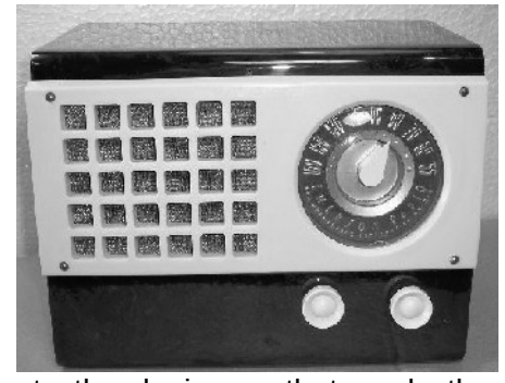
ate the designers that made them look so good.

Whether it is speaker & dial placement, escutcheon style, size, shape, color or materials used, someone had to be able to visualize that radio before it was ever produced. So next time you take a look at one of your high end prized pieces, or even just one of your handsome, yet (less expensive) "$30 Radios", Take a moment to enjoy its appearance, and appreci-