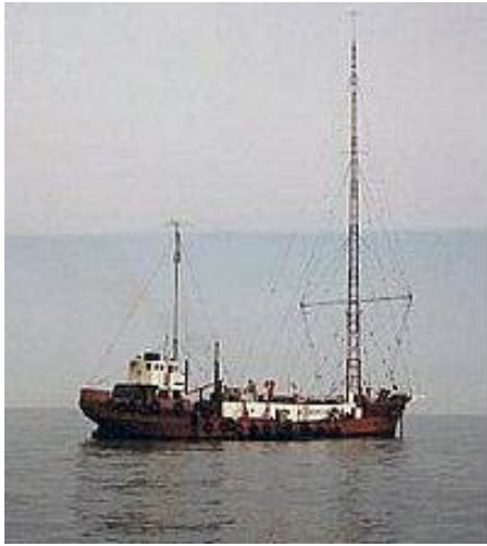
Above: The MV Mi Amigo, c. 1974, which had been used as the home of Radio Caroline South from 1964–1967. Radio Caroline was begun by Irish musician manager and businessman Ronan O'Rahilly. O'Rahilly failed to obtain airplay on Radio Luxembourg for Georgie Fame's records because it was committed to sponsored programs promoting major record labels; EMI, Decca, Pye and Philips.