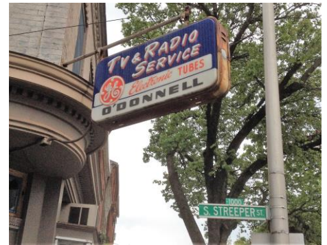
Above: Classic signage well preserved near Baltimore's Inner Harbor, corner of O'Donnell and Streeper Sts. Send us your picture of sign sitings!

When the "Act to Regulate Radio Communication" was passed on August 13, 1912, amateurs and experimenters were not banned from broadcasting; rather, amateurs were assigned their own frequency spectrum, and licensing and call-signs were introduced. By regulating the public airwaves, President Taft thus created the legal space for illicit broadcasts to take place. An entire federal agency, the Federal Radio Commission, was formed in 1927 and succeeded in 1934 by the Federal Communications Commission. These agencies would enforce rules on call-signs, assigned frequencies, licensing and acceptable content for broadcast.