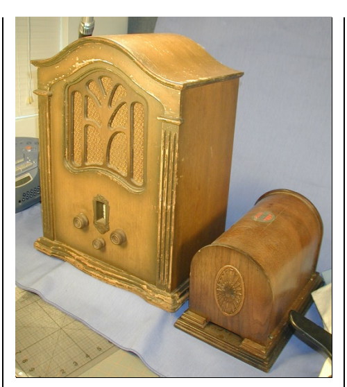
Above: The Electrifier was used with the Delco RA-3, the first in a series of radios designed and built by Delco in Rochester, NY. The model year is 1932. At the time, there were not any tubes that could deliver sufficient audio power with only about 30 Volts on the plate circuits. You needed voltages of 90 volts or better..... In this particular set the high voltage was to be provided by three large 45 Volt dry batteries wired in series. But if you wanted to run the radio completely from the Delco light plant, they had a far more interesting solution. That was a motor/generator set known as the Electrifier. Below: The Delco Electrifier, uncovered, showed the DC motor which ran off the Delco 32 Volt DC light plants. On the top of next column appears a home radio bulletin on the Electrifier product. Please magnify for better viewing.