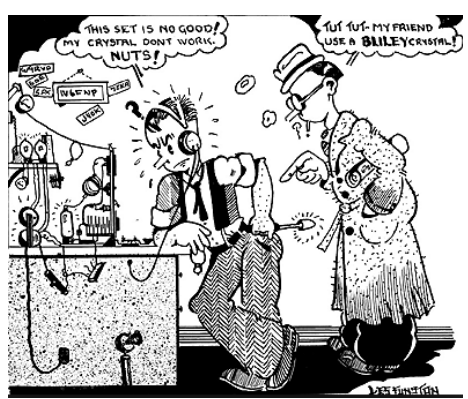
Dude, you left me very little room here, so 73's and goodbye for now from DVHRC.