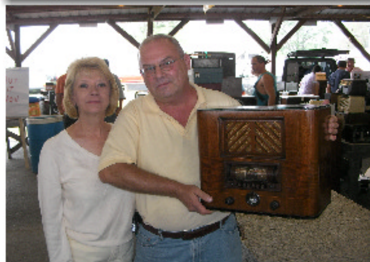
A few pix from September in Kutztown