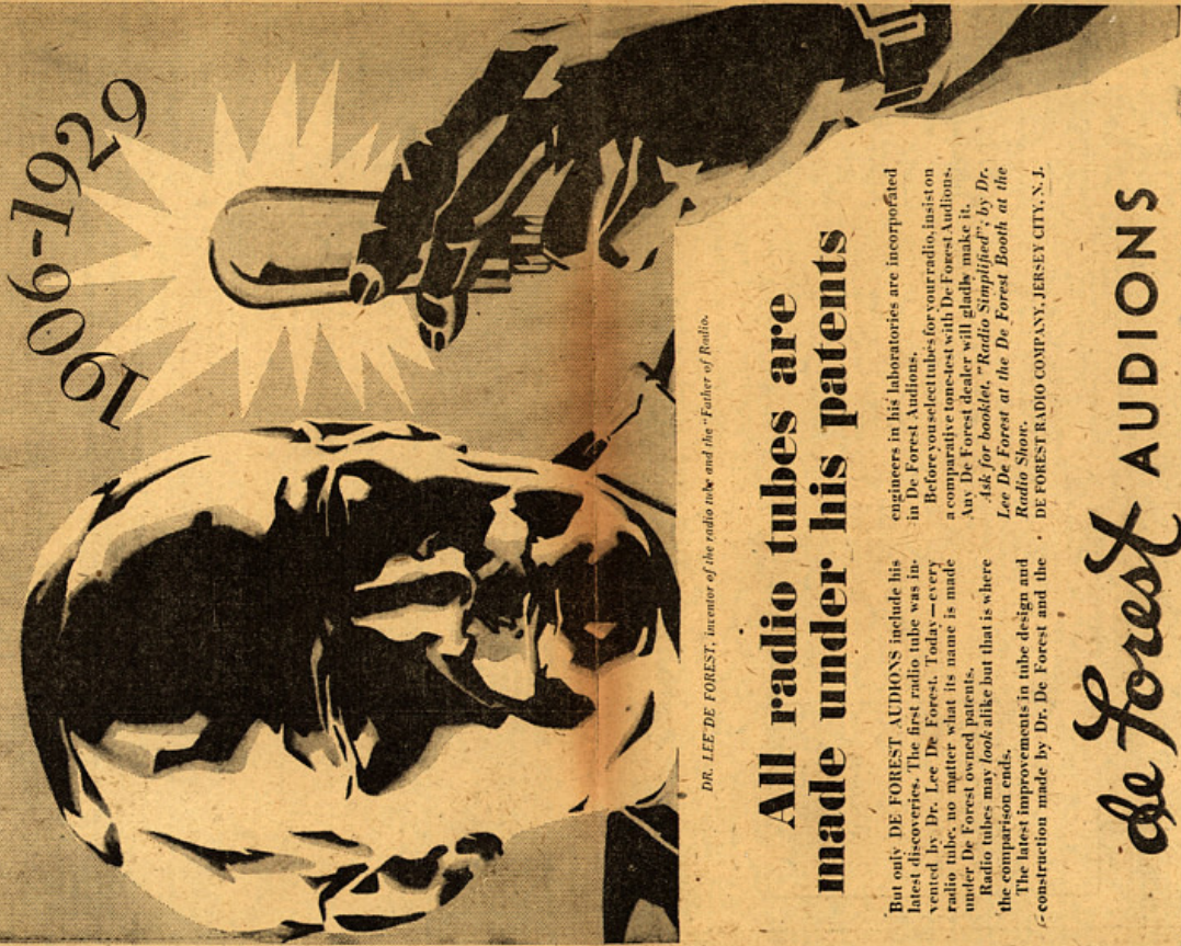
DR. LEE DE FOREST, inventor of the radio tube and the "Father of Radio"